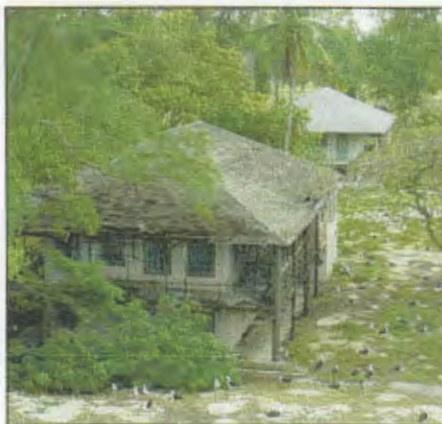
The Mess Hall, with its new roof, can be seen in the background.

A The Cable Station was showing signs of serious deterioration with leaking roofs prior to the Navy's withdrawal. In 2000, the Fish and Wildlife Service installed a new roof on the Mess Hall with a $308,000 Save America's Treasure grant, which also funded restoration of an ARMCO Hut, termite treatment on the Officer's Housing and theater and a new roof on the theater. In 2007, the Fish and Wildlife Service contracted with Mason Architects, Inc., to assess the condition of the Cable Station and several other historic buildings so we could develop a treatment plan. Mason concluded that only one of the Cable Station buildings, the Mess Hall, was in a condition that could be rehabilitated.