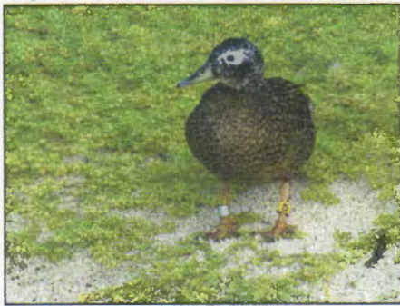
Laysan duck.

The Service already has cleaned up lead-based paint from 24 buildings, at a cost of more than $842,000. The total project is expected to cost $21 million. In July 2011, Northwest Demolition and Environmental (NWDE) of Tigard, Oregon, was awarded the contact to continue the remediation of lead-based paint at Midway. This is a year- to- year contract with six option years to complete the work. Approximately 71 buildings and the soil around them will be remediated. Six buildings are slated for demolition. A product called Maectite will be used to remediate and stabilize the lead in the soil, which will then be stored in a concrete lined cistern and capped.