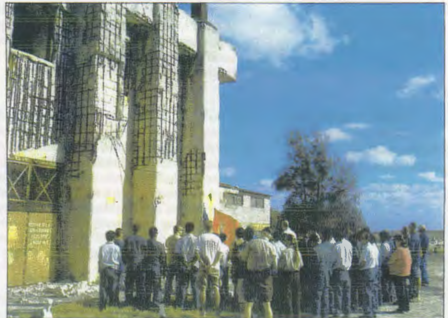
Above: Memorial service at the World War II command center.