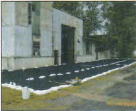
Shade cloth around the Torpedo Building.