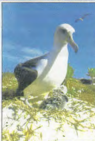
Left: Albatross and chick.